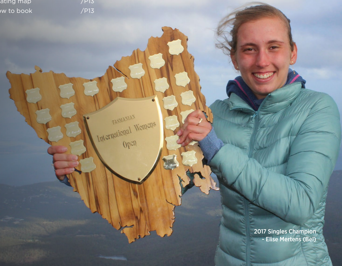
2017 Singles Champion - Elise Mertens (Bel)